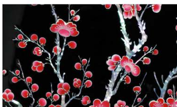
DISPLAY Lustrous Surfaces