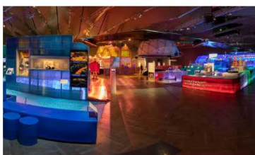
EXHIBITION The Future Starts Here