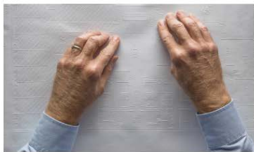
DISPLAY Without Walls: Disability and Innovation in Building Design FREE | From 10 Feb 2018 until 21 Oct 2018