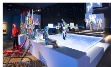
EXHIBITION Ocean Liners: Speed and Style