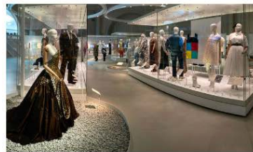
EXHIBITION Fashioned from Nature £12.00 | From 21 Apr 2018 until 27 Jan 2019