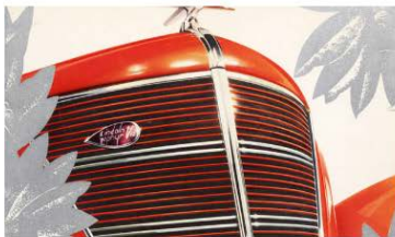
DISPLAY Printing a New World: Commercial Graphics in the 1930s FREE | From 3 Feb 2018 until 19 Aug 2018